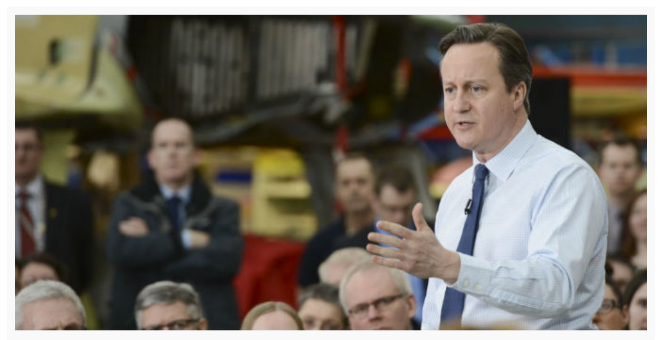
David Cameron visits the BAE Systems factory in Preston to talk about the EU referendum.

Yet press support for Bremain is likely to be half-hearted ('there is no credible alternative') and therefore rooted in the same grand narrative as Project Fear. The positive case for the EU in the UK has tended to be advanced on the grounds of jobs/trade plus influence and a bit of security. Gone are the days when a Prime Minister would stand up and extol the virtues of, for example, that most hubristic of all Brussels institutions, the European Commission. Yes, this really did happen. In November 2002 Tony Blair delivered a speech in Cardiff on the Convention on the Future of Europe. He focussed on the case for major EU reform and for Britain to be at the forefront of the new Europe that was being built under the stewardship of Valéry Giscard D'Estaing. He called for greater self-confidence in Britain to put its case and win in Europe, to engage, to lead, and to stop seeing Europe as something that happens to Britain, but as a process 'we do with others'. Thatcherite in parts, the speech also explained the idea of pooled sovereignty, why common European defence was a good idea, and, remarkably it now seems, urged that 'we should strengthen the Commission to enable it to better carry out Europe's agenda'.