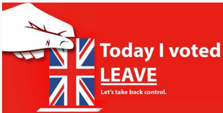
Vote Leave social media poster.

There is a sense of shock both in Britain and across Europe in response to the Brexit vote. But it should not come as a shock. The polls had consistently suggested that this would be a very close race and many had put the Leave side ahead in the days and weeks leading up the vote. We also know that referendums are highly unpredictable, and that voters often vote against proposals put to them by the government and supported by mainstream political parties and experts.