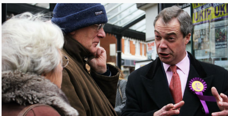
Nigel Farage campaigns in Eastleigh in 2013.

The referendum result is now well known. Leave won its strongest support in the West Midlands (59%), East Midlands (59%) and North East (58%) but attracted its weakest support in Scotland (38%), London (40%) and Northern Ireland (44%). The Leave vote surpassed 70% in 14 authorities, many of which had been previously targeted by Ukip, like Boston and Castle Point. Leave also polled strongly in Labour-held authorities in the north, winning over 65% in places like Hartlepool and Stoke-on-Trent. At the constituency level it has been estimated that while three-quarters of Conservative seats voted Leave, seven in ten Labour seats also did.