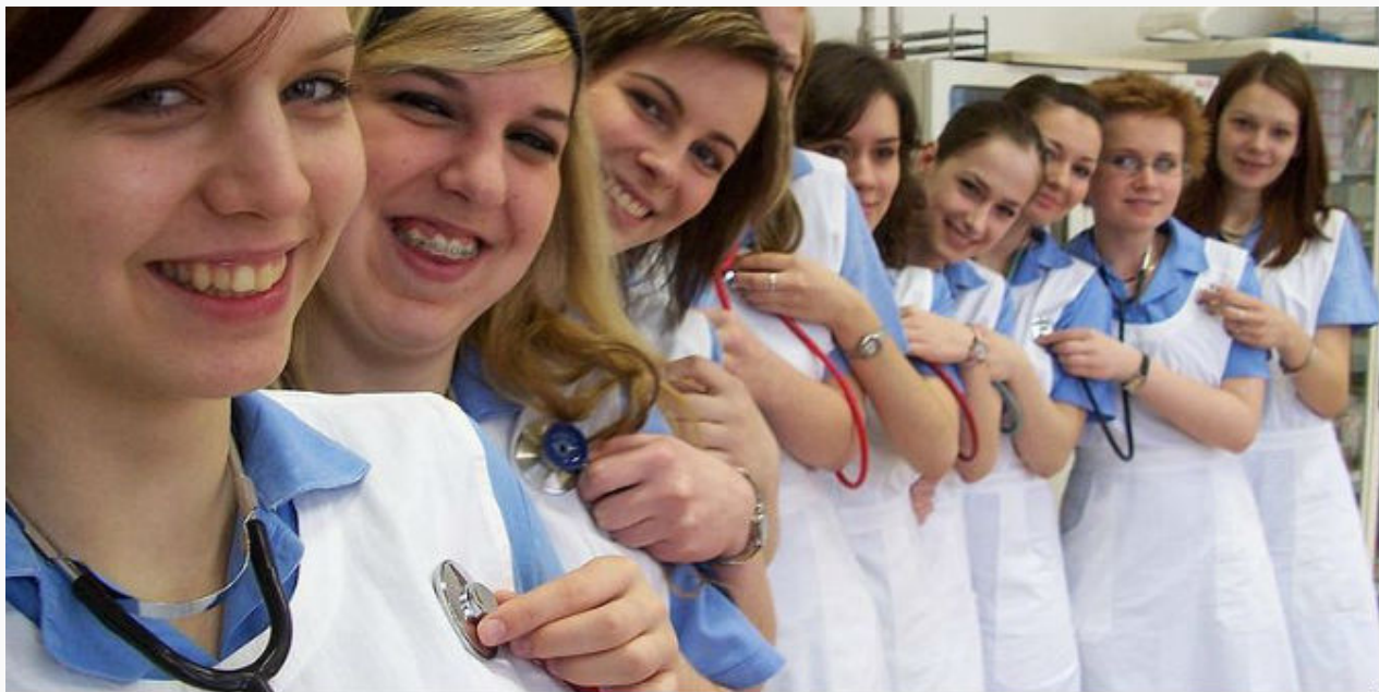
Czech student nurses in 2006.

The composition of the overseas nursing workforce has shifted dramatically in recent years; nurses from the European Economic Area (EEA) [1] are now increasingly prevalent, reflecting a change in recruitment practices due to tighter immigration rules, fewer employment opportunities across the Eurozone and health sector employers seeking to bring in more migrant nurses in general to alleviate shortages.