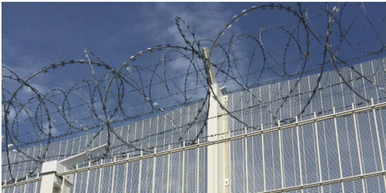
Fencing around the Eurotunnel terminal at Calais.

The three phases of Brexit – campaign, referendum, aftermath – have revealed three urgent problems. First, the lack of public faith in establishment politics. Second, the emotional deficit of the EU. Third, the return of a particularly ugly English nationalism. All of these were intimately connected in a campaign whose nature was fundamentally emotional. While the EU is no longer an immediate priority for the next government, public lack of faith and the return of national identity in England are urgent issues which a new government must carefully address.