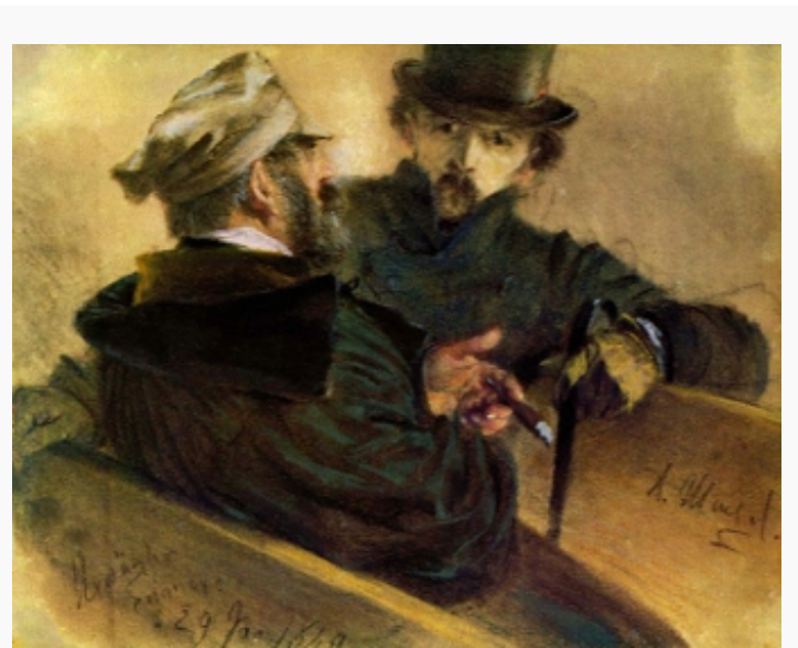
Zwei Urwähler im Gespräch, Adolph von Menzel (Public Domain)