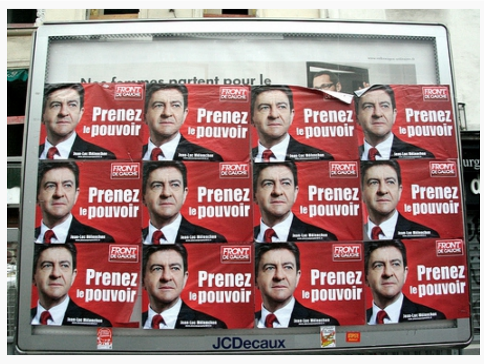
Election posters for the Front de Gauche and Jean-Luc Mélenchon

More than anywhere else in Europe, the notion of populism has been greatly used in French politics and academia. This is largely due to the persisting electoral successes of the Front National, an extreme-right party, from the mid-1980s onward. It is quite ironic to note that the reference to populism in French media and academia is inversely proportional to the presence and visibility of the 'people' in politics (understood as working-class or 'popular' classes). In other words, the less represented the 'popular' classes are in political parties, in parliament or in government, the more populism is branded a threat for French society.