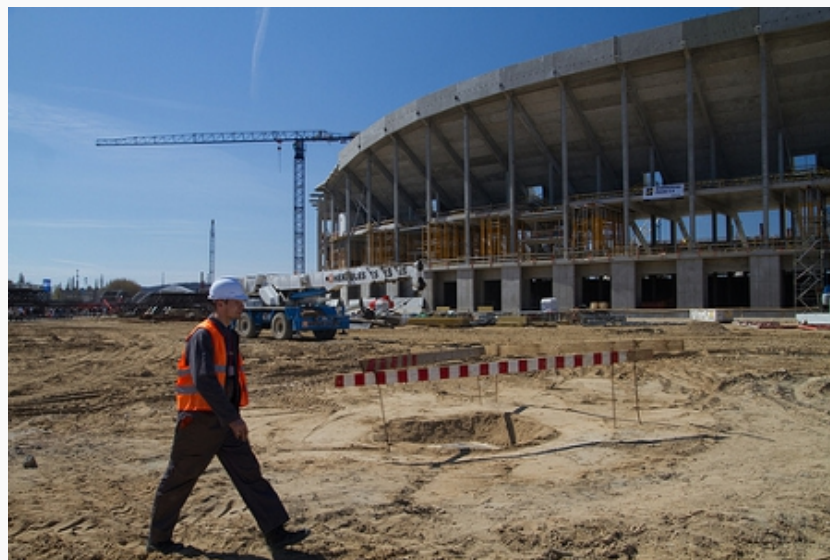
PGE Arena Gdańsk under construction in 2010

Poland was able to avoid an economic recession due to a unique combination of internal and external factors. Firstly, the country suffered no significant collapse in its banking and financial sectors. Personal debt in Poland remained low and the banking sector relatively well regulated. Secondly, Poland was not as dependent on the inflow of private credit and capital as some other small economies in the region, nor so heavily reliant upon exports. Thirdly, Poland had not joined or tied its currency to the euro and therefore could retain some competitiveness through devaluation. Finally, throughout the crisis, the Polish government continued to increase spending, particularly by raising public investment through utilising the money gained from an inflow of EU structural and cohesion funds.