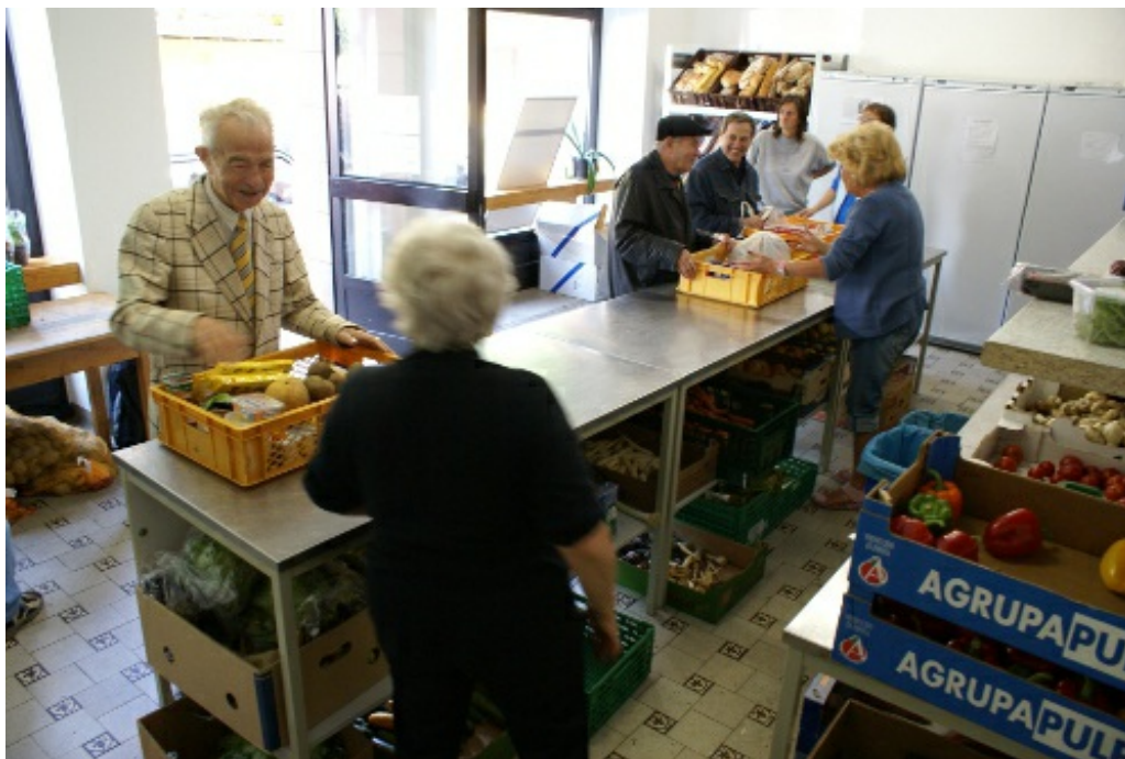
A old Russian tailor with celebrates the day at the food bank as an event. At this food banks the “guests” are separated from the volunteers by a counter.

The system of foodbanks is centred on questions of the legal form of foodbanks, the standards of food distribution and the rules concerning access and use. Users of foodbanks often perceive those rules as restrictive, discriminating and stigmatising. The distribution of donations of food by private persons within a volatile system (i.e. without guarantees, and dependent on numerous factors such as the amounts of food, personal feelings etc.) is diametrically opposite to the German constitution's criterion of unconditional help in the context of an institutionalised system of solidarity in a welfare state.