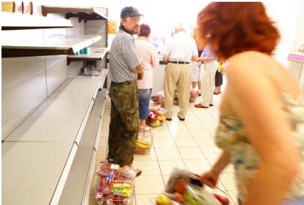
Queuing at the cash box. The empty racks show that this food bank is not a normal supermarket.