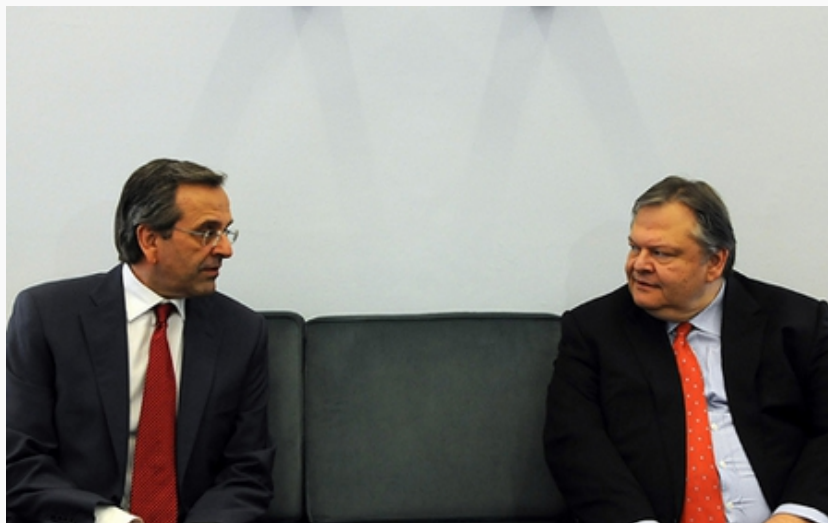
Leaders of New Democracy and PASOK, Antonis Samaras and Evangelos Venizelos

Despite a somewhat promising start, the coalition government of New Democracy (ND), PASOK, and the Democratic Left proved to be short-lived, giving way last month to a more compact bipartisan cabinet consisting of only ND and PASOK ministers (at an agreed ratio of two-to-one). Toiling under the shackles of a sclerotic austerity program, the first few true attempts at structural reform and downsizing of the wider public sector have met with mixed reactions and caused the three-party coalition government to implode. This is only the first episode in a new political era of short-lived coalition governments with shifting partisan compositions.