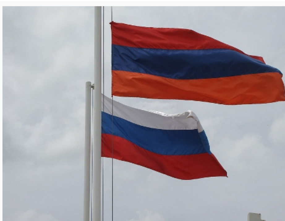
Flags of Armenia and Russia By Alexanyan ( [CC-BY-SA-2.0], via Wikimedia Commons