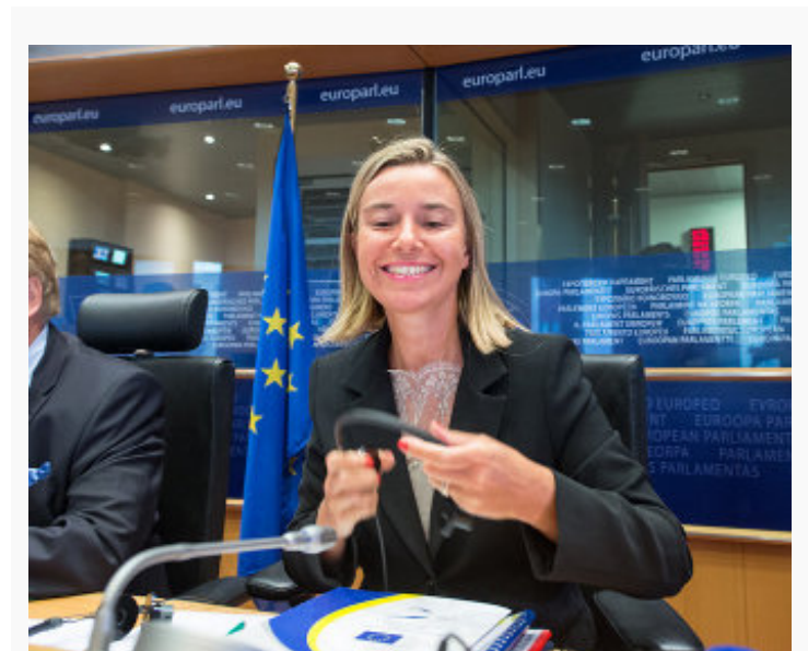
Federica Mogherini

Indeed, the choice of such an experienced politician provided a higher profile for the EU in external affairs. Nevertheless, the first High Representative was not generally encouraged to express independent positions if they had not been formally endorsed by the Council beforehand. In 1999, for instance, Solana publicly supported the idea that the EU should have a permanent seat on the United Nations Security Council, in addition to those of the United Kingdom and France. Promptly Ministers of Paris and London clarified that the High Representative's remarks were not reflecting common EU visions.