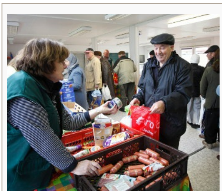
Foodbank in Hamburg

Since the end of World War II, no other reform has changed Germany more than Agenda 2010, with shifts in the way people think, feel and act. Using narrative portraits of those affected by this policy, in my book Schamland (Land of Shame) I argue that even the term "Hartz IV" marginalised a significant portion of the population in terms of social and cultural inclusion. "Hartz IV" has become synonymous with poverty, exclusion and charity. Even the leading German dictionary Duden coined the verb "hartzen", which they explain by referring to people who are "too lazy for any activity or job". The general level of suspicion of the unemployed generated by the reform couldn't be any worse.