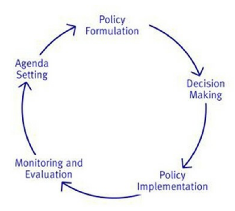
Figure 1: Examples of models of the policy process found in academia.

Process from the Rational Framework. Adapted from Policy Analysis: A Political and Organizational Perspective by William Jenkins (1978, p. 17).