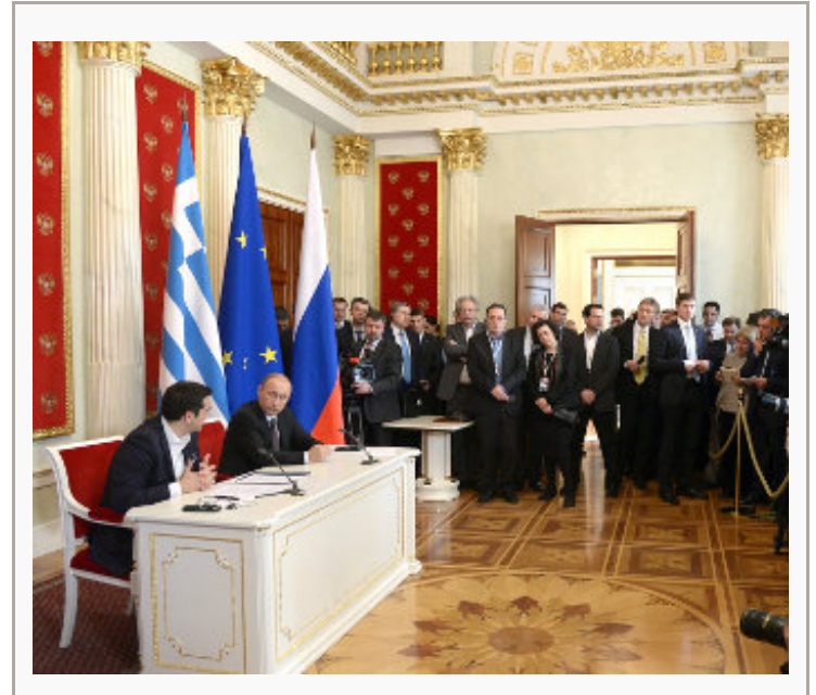
Alexis Tsipras and Vladimir Putin on 8 April 2015

Hence, relations between the two countries took the shape of possible cooperation in the areas of energy on the premise that pipelines starting in Russia would traverse Greek territory before ending up in other