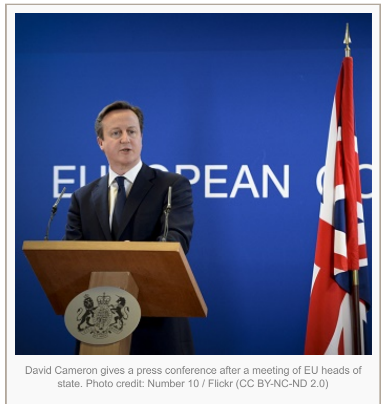
David Cameron gives a press conference after a meeting of EU heads of state.

The introduction of a "red card" mechanism would significantly alter the constitutional equilibrium in the EU and transform national parliaments into a collective veto player that could block the European Commission's legislative initiatives. The Lisbon Treaty's Article 12 TEU and Protocol No. 1 on the role of national parliaments as well as