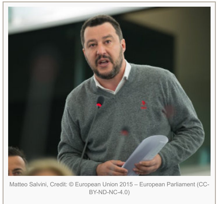
Matteo Salvini

He has also taken the risky (but, so far, electorally rewarding) decision to temporarily abandon an objective which had very much defined the Lega Nord throughout its history, before the party's founder Umberto Bossi was forced to step down as leader due to a damaging scandal in April 2012. As he became leader, Salvini set aside the Lega Nord's