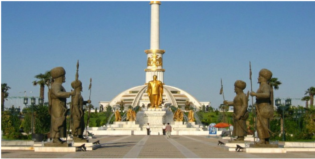
Independence Monument, Turkmenistan

But Dr Klaas also highlights the inherent weaknesses of authoritarianism, such as a complete lack of accountability for bad or dangerous policies. One example Dr Klaas cites is from Turkmenistan, where the former president Niyazov decreed that sick people would benefit from being surrounded by the opulent marble and gold surroundings of the capital Ashgabat, and closed Turkmenistan's rural hospitals.