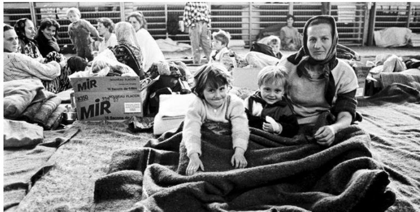
A family in a refugee camp in Tuzla, Bosnia and Herzegovina, during the 1991-1995 Yugoslav War.

These Islamophobic representations catch today's refugees in their net but exempted Bosnians. Light-skinned Bosnians wearing Western clothes were not 'visibly Muslim' in European symbolic politics, even when they were Muslim by religion and ethnic heritage, and did not resemble the stock figure of the Islamic fundamentalist and militant.