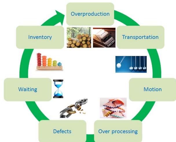
Fig. 1. The Seven Deadly Wastes of Lean Philosophy.

Presently, the service industry is trying to improve its performance by embracing the continuous improvement process so as to stay competitive and satisfy their customers. Hence for them to achieve this there is a need for this service industry to adopt the Lean production practice as a full business strategy. Below are the deadly wastes that affect service industry. The main aim of Lean production is to eliminate all type of waste within the production process. Waste includes all activities that do not add value to organisations or customer. It is any activity that customers will not pay for; thus it is important for organisations to identify the concept of this waste and reduce it. Earlier research by Taiicho Ohno design of seven wastes or "Muda" which form the core of "lean philosophy" that is faced by companies on how to identify and reduce them.