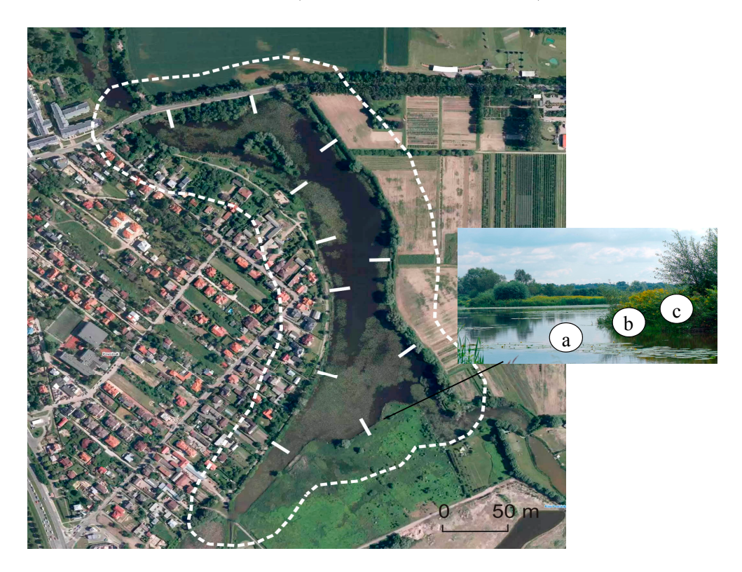
Figure 2. Research area (dotted line) and vegetation sampling plots scheme within transects; white circles: (a)—aquatic vegetation; (b)—vegetation of the rushes; (c)—terrestrial vegetation of the shores. Signs based on the Powsinkowskie Lake example.

parameters concerning the lakes quality were calculated as Spearman's correlations at p < 0.05 using STATISTICA 10.0 for Windows software (StatSoft Inc., Tulsa, OK, USA).