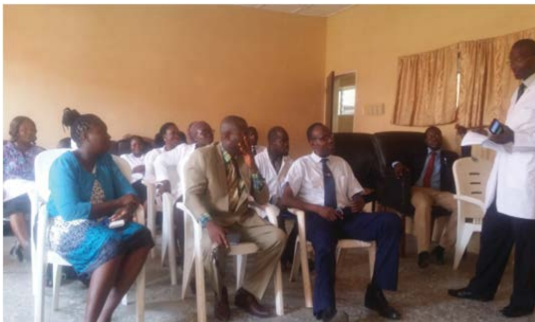
Figure 3 The local class room for training the local medical professionals.

Our host, Dr. Onakpoya took us to visit a local TV station in the town. Then we visited the King palace which was magnificently built including court of law. After that we visited various