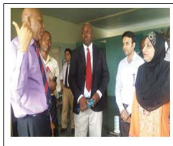
Figure 4 The CEIF team remained involved in teaching and training nurses, to ICU management, perfusion and physical therapy.