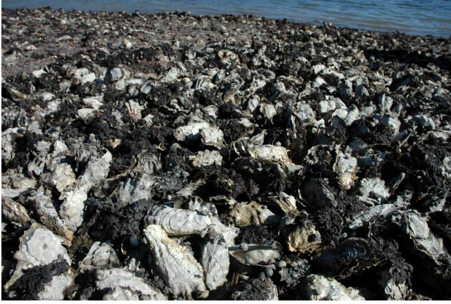
Figure 1: Extensive Crassostrea gigas beds covering soft sediments in the Yealm, Devon (photo Keith Hiscock)..

of the Pacific Oyster Crassostrea gigas . This species was first introduced to the UK in 1890, it was the reintroduction in 1962 under licence from MAFF for aquaculture that resulted in the successful invasion of natural rocky and soft sediment intertidal habitat in the UK by this species (Walne, 1971; Herbert et al. , 2012). Whilst this species attaches to hard substrata on the rocky shore, it is now found in dense beds associated with soft sediment in estuaries, including the River Thames estuary as is the invasive clam Venerupis philippinarum (Worsfold, pers. comm.). Settlement in Crassostrea species is facilitated by a conspecific chemical cue (Pawlik, 1994) and it is likely that the establishment of a few pioneers leads rapidly to further settlement and colonisation. Climate projections are thought likely to result in C. gigas successfully recruiting annually in southwest England, Wales and Northern Ireland by 2040 in response to continually warming marine environmental temperatures (Figure 1; Maggs et al. , 2010).