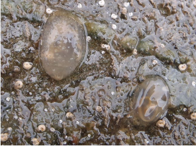
Figure 2: The invasive tunicate Corella eumyota on the rocky intertidal reef at Holyhead, Anglesey.