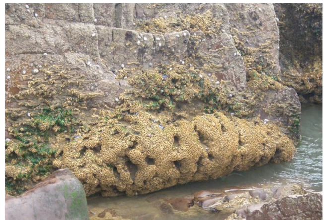
Figure 4: Example of veneer formation of S. alveolata at Bude, north Cornwall.

Blue mussels can form high-density beds which function as a biogenic habitat for a wide range of epifaunal and infaunal species (O'Connor and Crowe, 2007), and are an important food source for seabirds. Blue mussels are boreal ( Mytilus edulis ) and cosmopolitan ( Mytilus galloprovincialis ) in origin. Neither species is exposed to environmental temperature regimes close to their thermal tolerance limits in the UK and Ireland and rising temperatures are not considered to be a major threat to these species over the coming years. Mussels are shell-forming organisms and ocean acidification represents a potential threat to shell-formation and other physiological processes. In a short mesocosm experiment, Beesley et al. (2008) found that CO 2 -acidified water reduced the health of Mytilus edulis through elevated levels of calcium