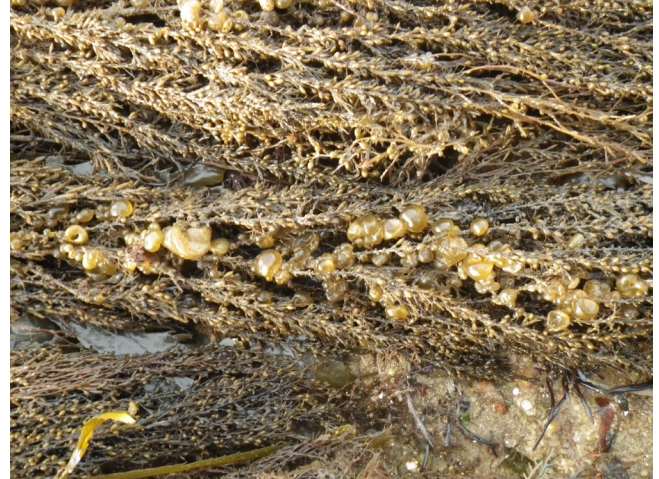
Figure 3: Sargassum muticum acting as a host for Colpomenia peregrina .

reproductively active and self-sustaining (Campbell, 2012). Natural estuarine and open coast colonisation has increased over the last 2 years in the vicinity of oyster farms in the western English Channel and Scotland. Evidence suggests that the risk to biodiversity from wild settlement of Pacific oysters relates not so much to local changes in species diversity per se but to the extent of habitat transformation (Herbert et al. , 2012).