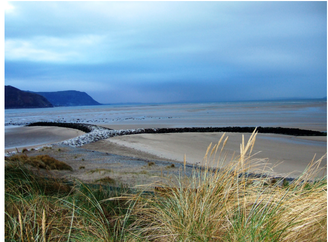
Figure 5: Coastal defence structure at Westshore, near Llandudno, North Wales.

These structures are typically built in locations that are dominated by sedimentary habitats and have the potential to provide habitat for a wide range of hard-bottom marine species. It has been suggested that the structure and functioning of colonising assemblages are analogous to those living on natural rocky shores and that the artificial structures can sometimes function as surrogates or stepping stones between areas of natural rocky habitats (Thompson et al. , 2002; Martin et al. , 2005; Branch et al. , 2008). However, there is mounting evidence that epibiota and fish assemblages associated with artificial structures differ from those on