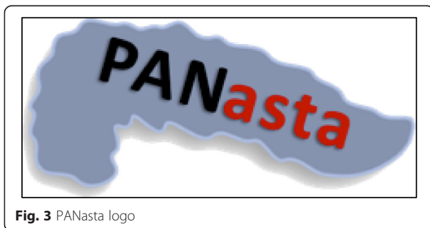
Fig. 3 PANasta logo

This study is ambitiously intending to randomize over 500 patients undergoing pancreatic surgery. These numbers are powered to detect a 10 % absolute point reduction in the primary endpoint of POPF – which is a relevant difference in surgical trials. Included is a generous dropout rate and account is also taken of patients who are not randomized if unresectable disease is encountered at laparotomy. Furthermore, randomization will be undertaken following resection, just prior to pancreatic anastomosis; therefore, maximising surgeon equipoise. One of the prime reasons that the current medical literature base on pancreatic anastomosis is so poor is the lack of operative standardization not only between individuals but also between centers. In order to diminish this as much as is possible a number of safeguards are built into this study: notably incorporation of a feasibility pilot study within the first 6 months; a pre-pilot consensus meeting; formulation of an operative manual and operative photographs.