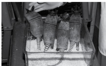
Armadillos used in leprosy research.

http://www2c.cdc.gov/podcasts/player.asp?f=8640494