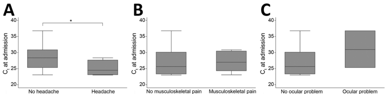
Figure 2. Comparison of the most common post-Ebola syndrome symptoms with admission C t results, 34th Regimental Military Hospital, Wilberforce Barracks, Freetown, Sierra Leone. A) Headache, B) musculoskeletal pain, C) ocular problems. Specific C t levels are shown in Table 2. *Indicates significant difference (p<0.03). C t , cycle threshold.

Patients described musculoskeletal pain variously as problems with walking or moving or pain specific to 1 area (such as knees, thighs, or back) or generalized musculoskeletal pain. (21%–52%). Most often, patients