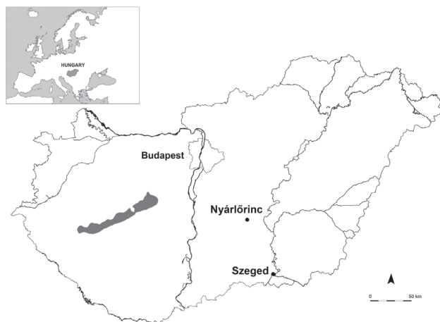
Figure 1. The location of Nyárlőrinc and Szeged in the map of Hungary.

noses of TB in two osteoarcheological cases coming from medieval Hungary.