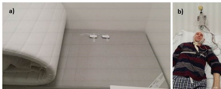
Figure 1. Left: a) BCG equipment setup. Right: b) PSG equipment setup. [1]

Murata SCA11H BCG Sensor Node was used as the BCG measurement device [7]. The BCG node (83.7 mm x 40.7 mm x 17.6 mm) consists of Murata SCA10H BCG Sensor Module, WiFi module and a power cord. The module includes Murata SCA61T accelerometer and a microprocessor. The analog one-axis accelerometer detects the BCG signal with a resolution of 90 \mu\text{g} and operates with 1 kHz sampling frequency. The detected acceleration signal can be processed with an intelligent algorithm in real time. The BCG algorithm reports multiple parameters at 1 Hz frequency. The output parameters in BCG mode are timestamp, heart rate (HR), respiratory rate (RR), relative cardiac stroke volume (SV), heart rate variability (HRV), signal strength, bed occupancy status and beat-to-beat intervals (b2b). The BCG node was attached under the bed mattress with another node as a backup, as seen in the section a) of Figure 1.