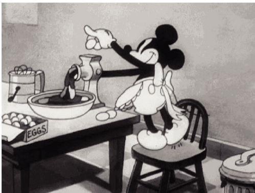
The Grocery Boy, 1932 (short)