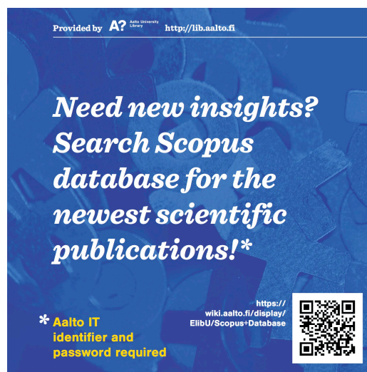
Figure 4 QR code poster leading to a single resource.

What follows is an examination Aalto University Library's digital portals elements of UX. Figure 4 presents a QR code poster used within the Aalto University Learning Hubs.