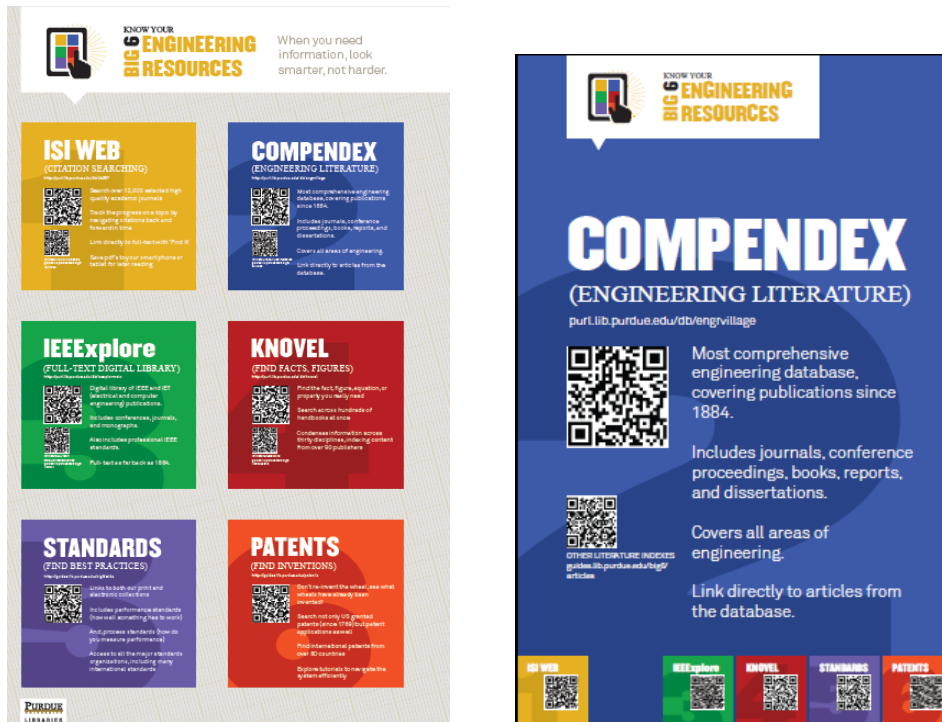
Figure 5: Big 6 QR poster linking to mobile portal of Purdue resources (on left) and poster, focusing on one of the Big 6 topical areas (on right).

Two main styles of users are addressed in this design, the quick searcher who is looking for some information immediately, and who has little bandwidth on their mobile device in which to view resources they find. The other is a researcher who has a deeper, long-term need for information and is willing to find out more about the resources available. They might read about the resources and do a more in-depth search later on a device that can accommodate more information on a screen (e.g., on a desktop or laptop computer).