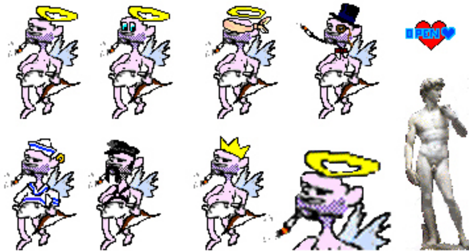
Picture 8. Cupid's set of avatars

Cupid has a total of ten different avatars (picture 8.). He changes his look mostly with imaginary parameters of romance, love, flirting and sex. Small visual tricks add a lot to his characteristics. Some of the keywords and cupid's lines are designed to some particular avatar, which he keeps wearing until another keywords triggers a new look. Parts of his dialogue he just says with the avatar he happens to be wearing, which adds a level of different possible meanings with the element of randomness and surprise: the same line with a different avatar might create a different meaning.