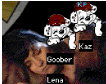
Picture 5. Sleeping tight

cuddle up with me. Somebody wearing animated dancing avatar may very well provoke the whole crowd to dancing mood.