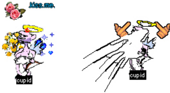
Picture 9. Cupid has received both loving and aggressive mementos.