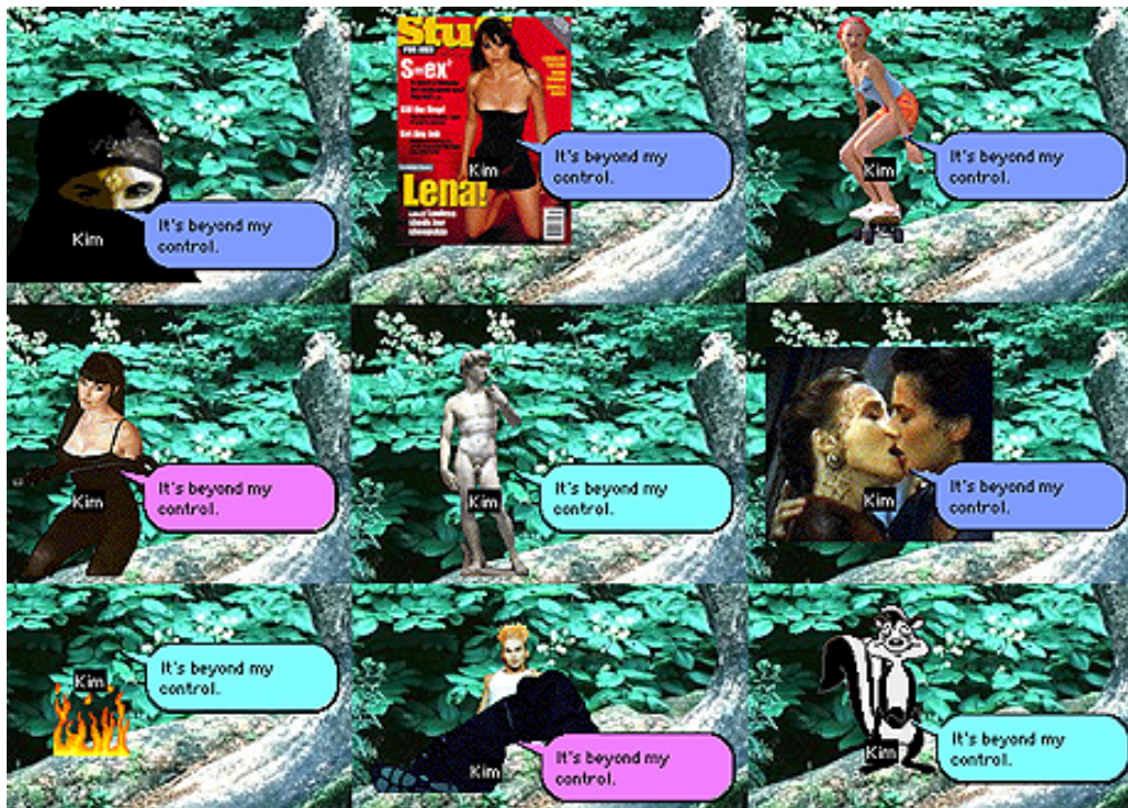
Picture 6. Avatar adds meaning to message.