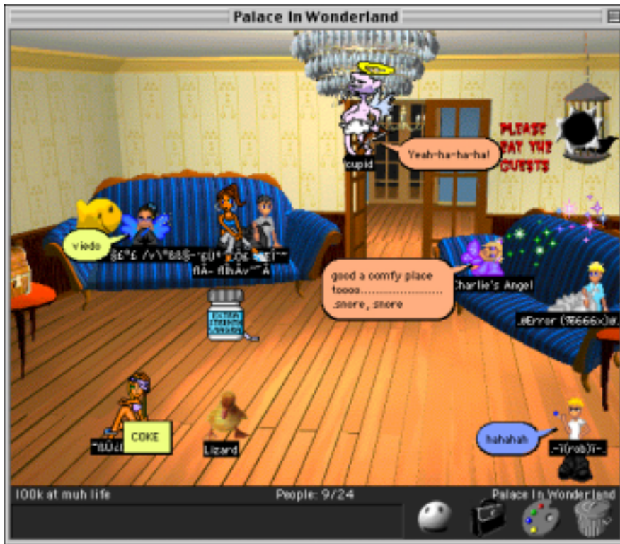
Picture 3. Set Dressing and gang avatars.