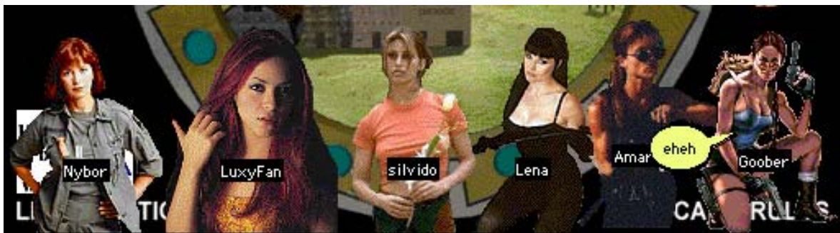
Picture 10. Rank of females with attitude.

Question: Can you guess which one of the female avatars below is a male in real life?