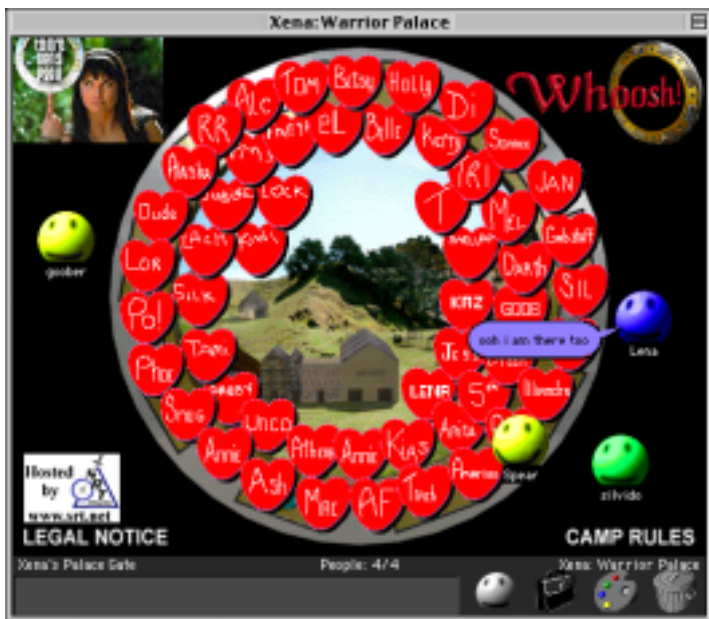
Picture 12. Around Valentine's day regulars got their own hearts at XWP gate. I wonder how those felt, who did not get a heart of their own.

In wider public forums the XWP-community does not define the sexual diversity as one of its characteristics, instead for example the wide range of ages and multiculturalism are subjects of enthusiasm, because everybody in XWP seem get along with each other despite of these differences. However, the sexual diversity is recognized inside the community and it is kind of the "meter" of democracy: as long as everybody, regardless of gender and sexual preferences get along, the community sees itself as an exceptionally well functioning. A shared divergence of a small community in comparison to society at large probably enforces the sense of community in XWP. It repeatedly manifests itself as a community, and indeed a good, democratic and enjoyable one.