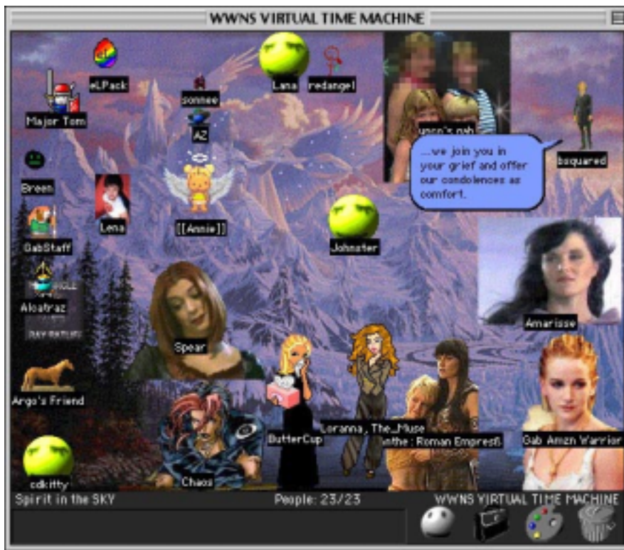
Picture 13. Xenapalace community comes together to Memorial service to pay respects to one of its members.

August 2000 xenapalace's mailing list received news that one its regular members had been in a serious accident. The following day became another e-mail to xenapalace-list announcing that she had died [14]. After that the notorious speed of online communication proved to be an understatement. Within few hours the XWP's town was filling with flower-props, a web site was made to pay respects and share thoughts. Someone in community's mailing list started a chain letter to honor deceased's memory. Many signed it using both their avatar names and real names – reducing the level of anonymity, which is typically attached to virtual communication. Next thing made, since technically props cannot be floating freely just anywhere around The Palace for too long, was a room where people could leave props in her memory. The room was filling with flowers, teddy bears, hearts and other affectionate pictures closing to the technical limit so fast that the old props were captured to the background image to get new props in.