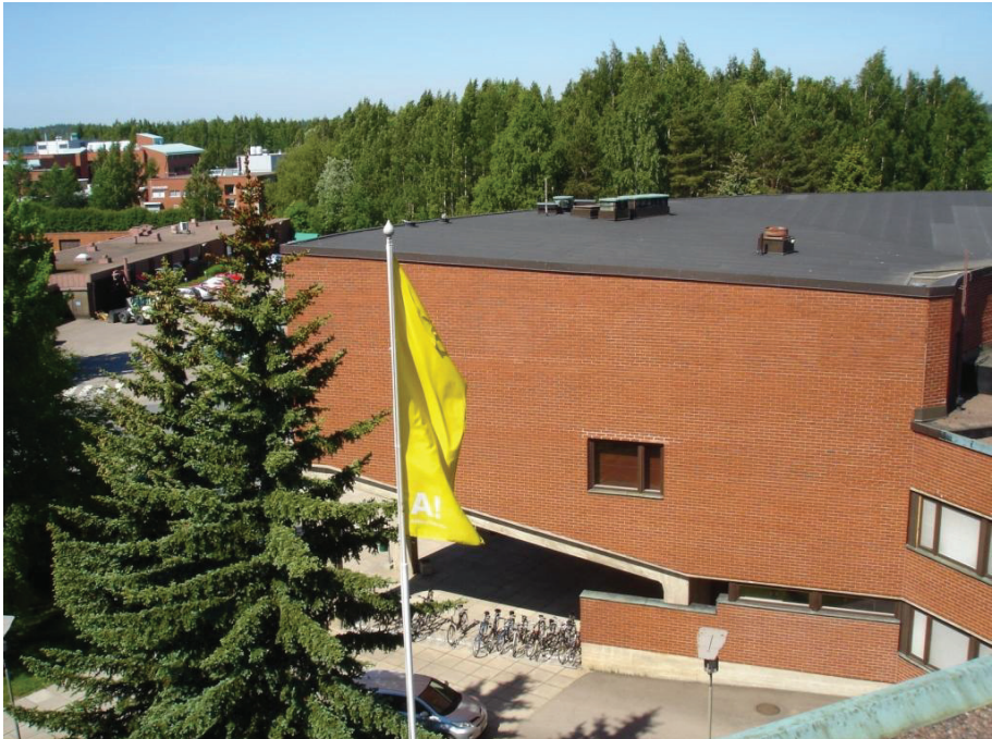
The RAD Department in the Otaniemi campus of Aalto University is presently within the School of Electrical Engineering.

The Department of Radio Science and Engineering (RAD) is a small but essential part of Aalto University, a new University formed in January 2010 as a merger of three universities: Helsinki University of Technology, Helsinki School of Economics, and the University of Art and Design in Helsinki. Located in Otaniemi, Espoo, the RAD department belonged in 2011 as one of the seven departments to the Aalto University School of Electrical Engineering. Until the end of 2010 the School of Electrical Engineering was known as the Faculty of Electronics, Communications and Automation within the Aalto University School of Science and Technology, which was the successor of the century-old Helsinki University of Technology (TKK). The history of TKK could be traced back to mid-19 th century when it was founded as the rather modest Helsinki Technical School. The institution was granted university status in 1908 by Emperor Nicholas II who was the Grand Duke of Finland until his abdication in 1917.