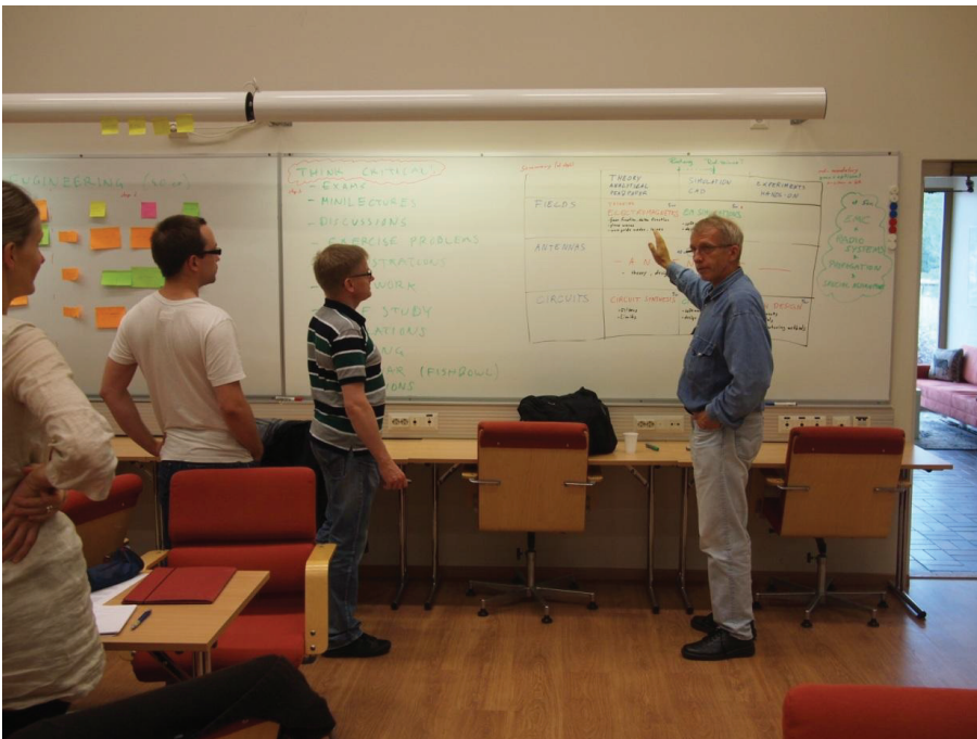
Envisioning the teaching of the future.