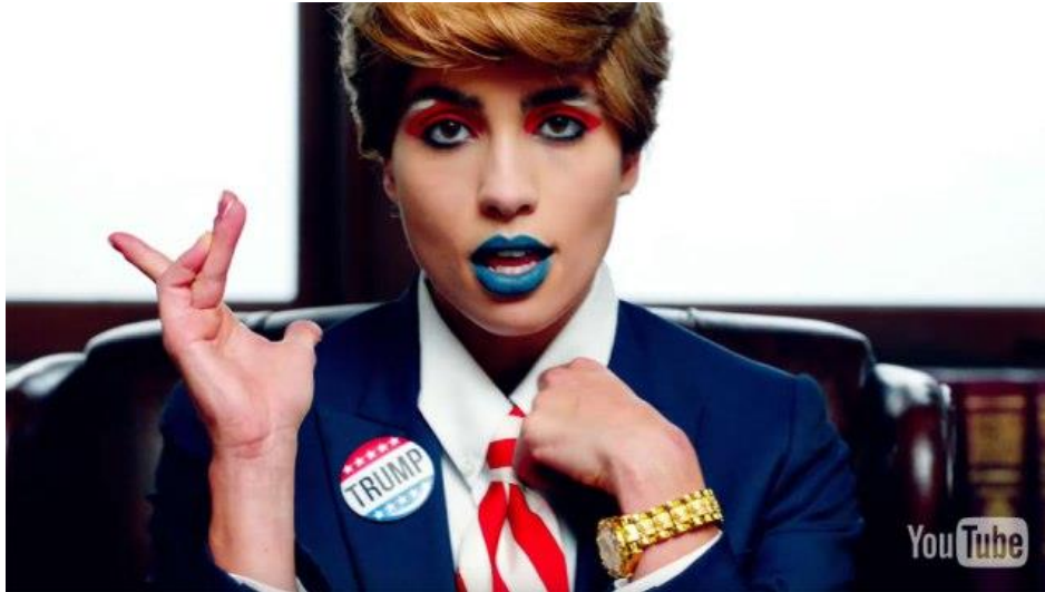
Nadia Tolokonnikova of Pussy Riot, 'Make America Great Again' (October 2016)