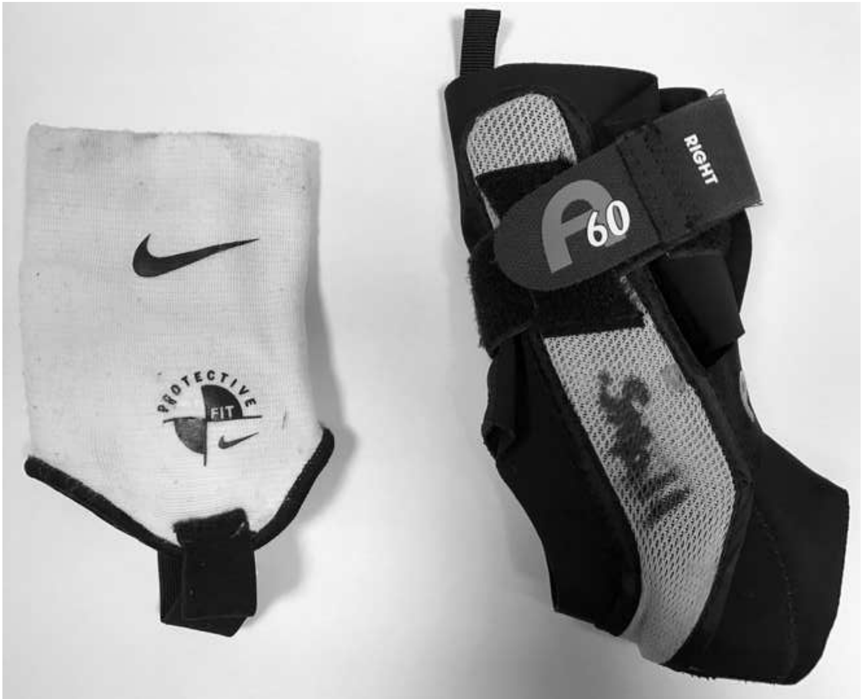
Figure 1- Photos