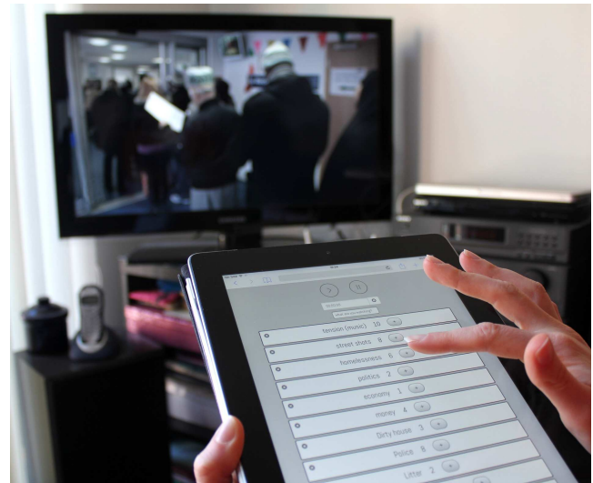
Figure 1. Mock-up of SG being used as a second-screen

to complete a “homework” exercise. These involved using SG whilst watching television. Participant experiences and the outcomes of their ‘spotting’ activities would then be discussed in the following workshop. Overall this formed three workshops, and two homework activities per group.