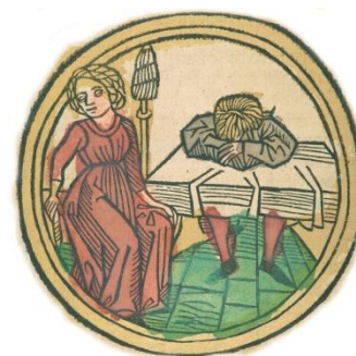
Figure 1: A German woodcut depicting the depressive qualities of the melancholic humor.

One approach was humoral theory which, as was outlined earlier, has been greatly focused upon by historians and has led to the dominance of melancholy in modern historical works, with other psychological illnesses and theories being overlooked as a result. Nonetheless, it is still necessary to outline the theory here. Between 1511 and 1521 Thomas Linacre, a humanist scholar and physician, translated Galen's ancient Greek works into Latin; making humoral theory widely available to English gentlemen. 70 This encouraged a move away from the Devil as an explanation for unexplained illnesses. Humoral theory stated that, in order for the body to remain healthy, each of the four humors: blood (sanguine), black bile (melancholic), yellow bile (choleric) and phlegm (phlegmatic), had to remain balanced. The melancholy humor was directly linked to mental wellbeing, which is portrayed in illustrations such as the woodcut displayed above (Fig. 1). 71 As the woodcut illustrates, an imbalance of the melancholic humor caused the depressive illness of melancholy. 72 Thus, mental illness, like physical illness, was sometimes considered as an upset of the humors.