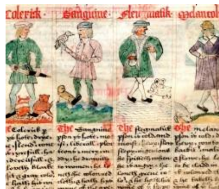
Figure 2: A sixteenth century illustration depicting the melancholy figure (far right) as an elderly man with a walking stick and grey hair.

A commonly held idea was that the elderly were thought to be the most vulnerable to melancholy. This notion was perpetuated primarily by humoral theory, but was common in the alternative sixteenth century view of the world. Take, for example, the contemporary example shown to the right (Fig. 2), which depicts the melancholy figure as a frail, elderly man with a walking stick. 87 Surphlet's translation stated that 'olde folks' and 'gelded men' had questionable masculinity, so were vulnerable to a melancholic imbalance. 88 This is an element of early modern understanding which will be explored in greater detail