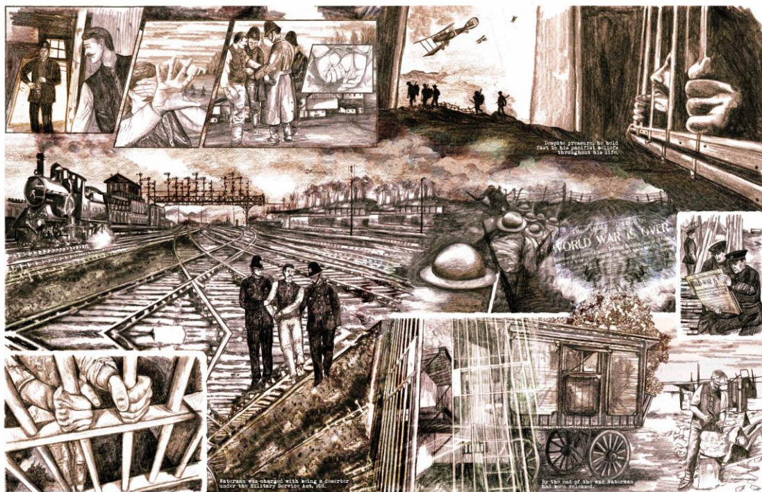
Figure 3: Copyright Kremena Dimitrova and Bishop's Stortford Museum

The washed out sepia of the graphic novels and panels convey both the utter exhaustion caused by the conflict as well as the emotionally charged and tumultuous atmosphere of the times, as can be seen in the picture below. The colour of the walls, painted grey, represents the dismal and monotonous effect of war. Likewise, the handwriting on the panels is made small and intimate in order to engage the visitor's sympathy. Finally, the room's sparse yet bright lighting is, occasionally and depending on where one stands within the exhibition space, suggestive of an interrogation lamp. In their totality, these elements shift the exhibition away from a fully coherent and chronological narrative towards a rather more disjointed atmosphere, deliberately engendering a sense of unease and negative emotional responses that reveal the horrors of the war to the museum visitor, thus bringing the police stories vividly to life (see Figures 3 and 4).