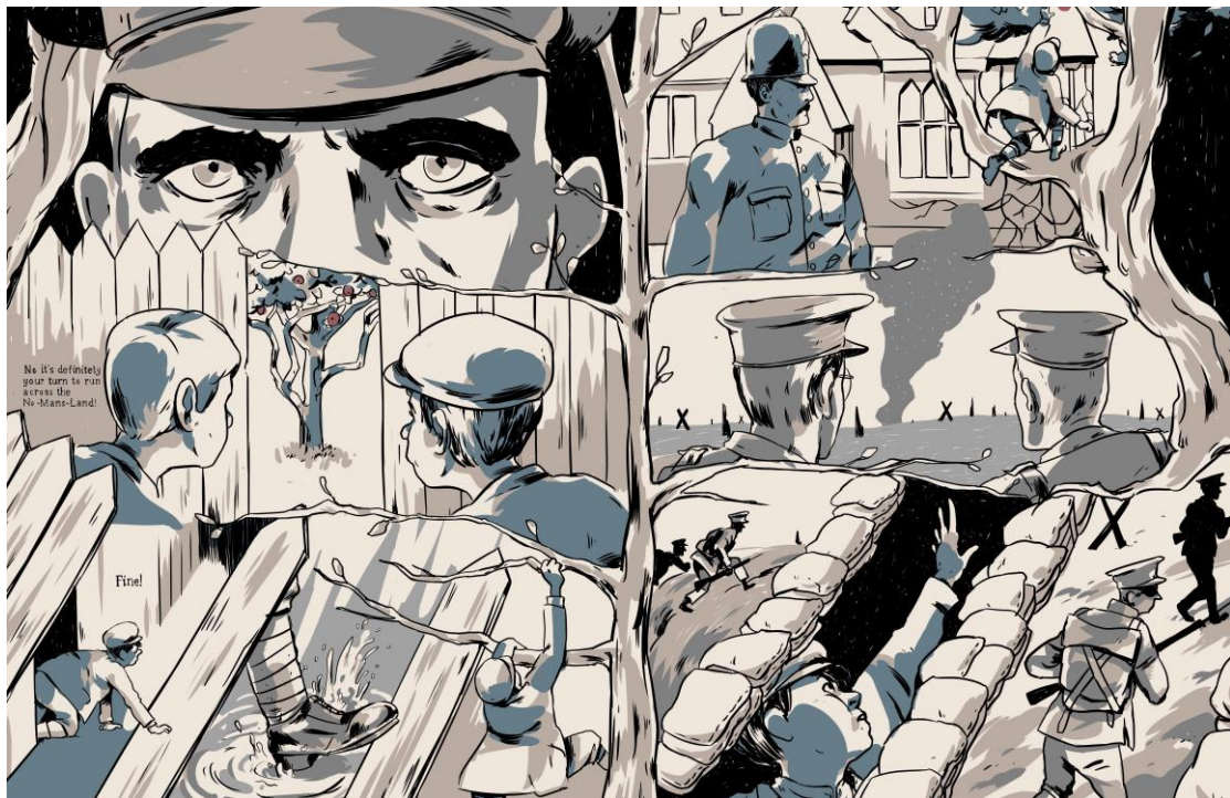
Figure 2: Copyright Michael O'Brien and Bishop's Stortford Museum

experience literacies. 15 Thus, literacy can no longer be understood as a single, knowable quantity that is both narrow and standardised, but rather it encompasses many different perspectives, including that of the graphic novel. In this case it conveys a very visceral, immediate and easily accessible sense of the catastrophe that the war brought to a small English town, enabling communication of the stories that lie penned within the police records (see Figure 2).