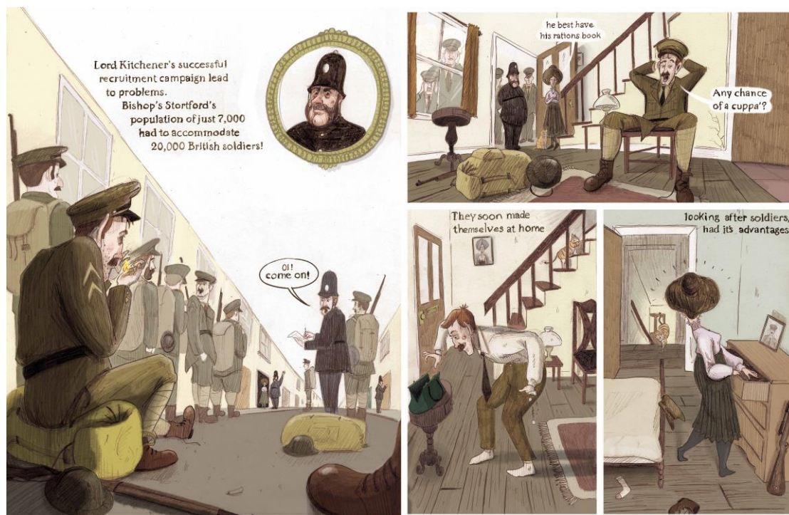
Figure 4: