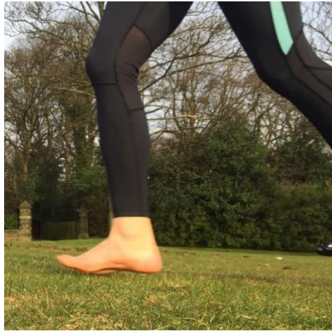
Figure 2: Observation of shod (left) and barefoot (right) running at a grass park.