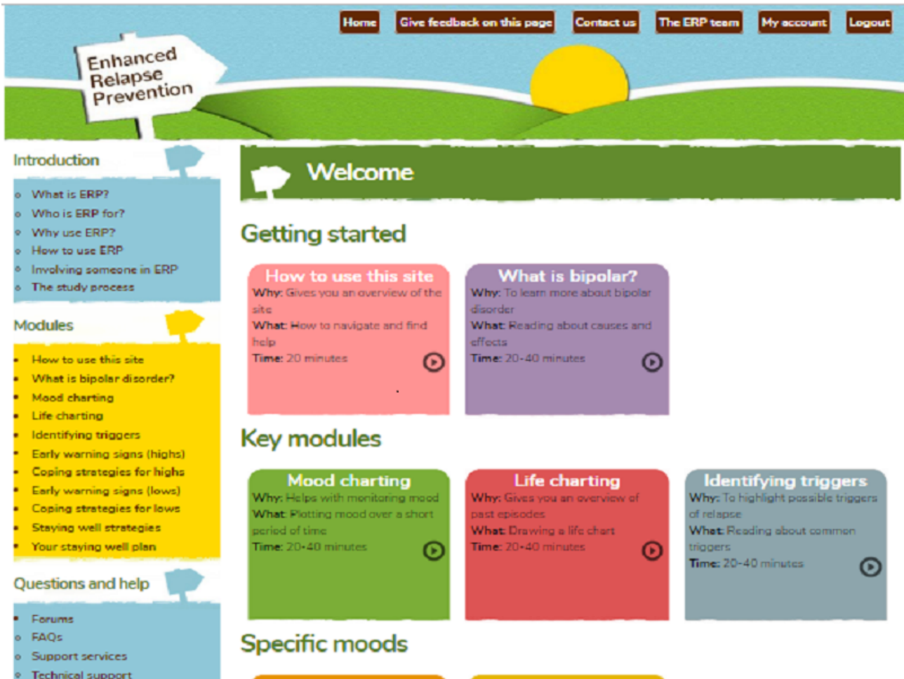
Figure 1. The online enhanced relapse prevention intervention (ERPonline) home page - top of page.