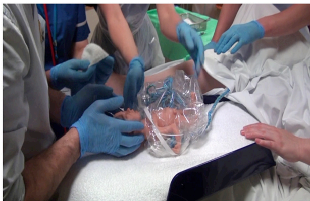
Figure 5 Demonstration of how to set up the LifeStart trolley for neonatal care beside the mother immediately after birth at vaginal births.