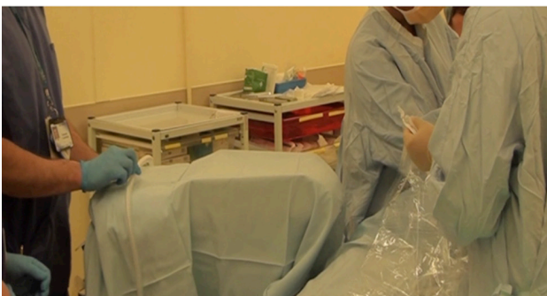
Figure 6 Demonstration of how to set up the LifeStart trolley for neonatal care beside the mother immediately after birth at caesarean section (note: the neonatal team should be scrubbed to maintain the sterility).

Prior to birth the midwife caring for the woman and the neonatal team need to discuss the potential management required for the individual baby and the best side of the bed to locate the platform or trolley.