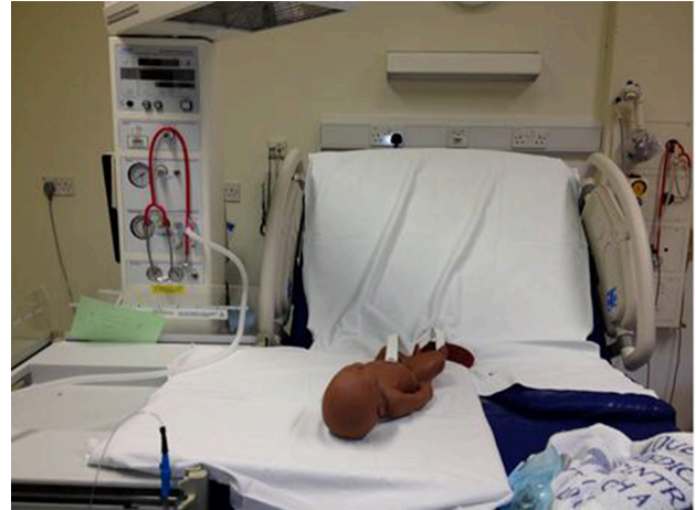
Figure 3 Demonstration of how to set up standard equipment for neonatal care beside the mother immediately after birth at vaginal births.