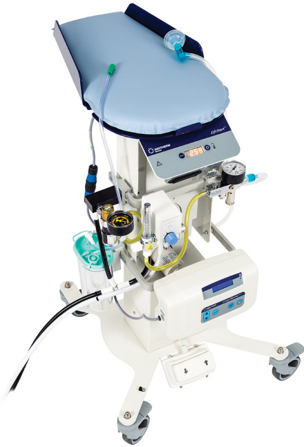
Figure 1 The LifeStart trolley.

standard equipment (the Draeger Resuscitaire and Fisher and Paykel CosyCot) and the LifeStart trolley. The set up required for each of these platforms is slightly different.