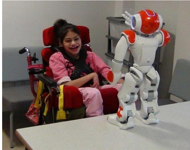
Figure 2. ST repeating back to the robot the utterance it has just emitted.