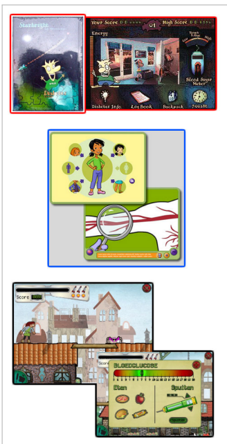
Figure 2: PC games.

Up: Starbright Life Adventures - PC CD 1999, Middle: Dbaza Diabetes Education for Kinds - PC CD 2003, Ranj's GRIP - Online Flash 2008