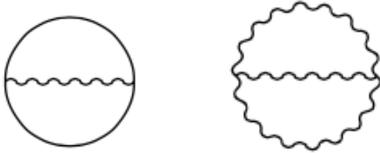
Figure 1: Vacuum diagrams that scale as M^6/\kappa^2 .

those in Fig. 1, where the solid lines denote matter propagators, and the wiggly lines are gravitons. For \kappa \sim M_{Pl} , and a cutoff as low as M \sim \text{TeV} , the numerical value of their regularized contributions is already thirty orders of magnitude above the dark energy scale. The contributions \sim M^8/\kappa^4 come from diagrams with either more, or higher order, graviton interactions, such as those in Fig. 2. Curiously, if the cutoff is as low as TeV their regular-