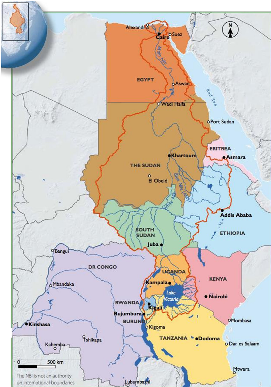
Fig. 1 The Nile River Basin.

military confrontations between the two countries since the Egyptian invasion of present Eritrea in 1876 (Yohannes 1999), the disputes between Ethiopia and Egypt over the allocation and use of the Nile waters have not only historically affected their relationships