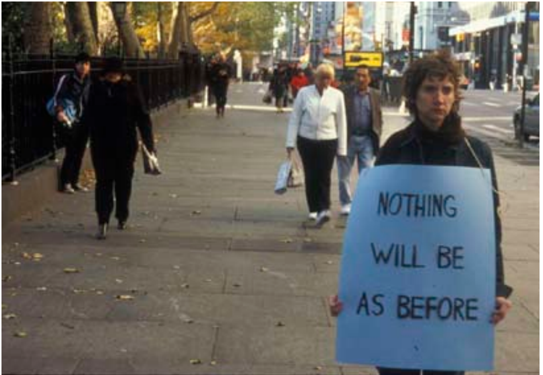
In the Near Future 2005–ongoing 9 slide projections, looped