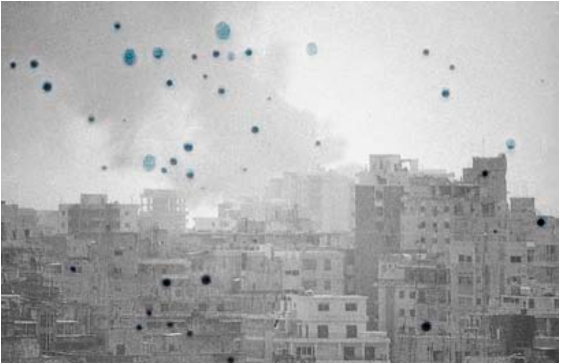
Untitled (1982–2007) Beirut/New York, 2008 19 ink jet prints, 43.2 × 55.9 cm each