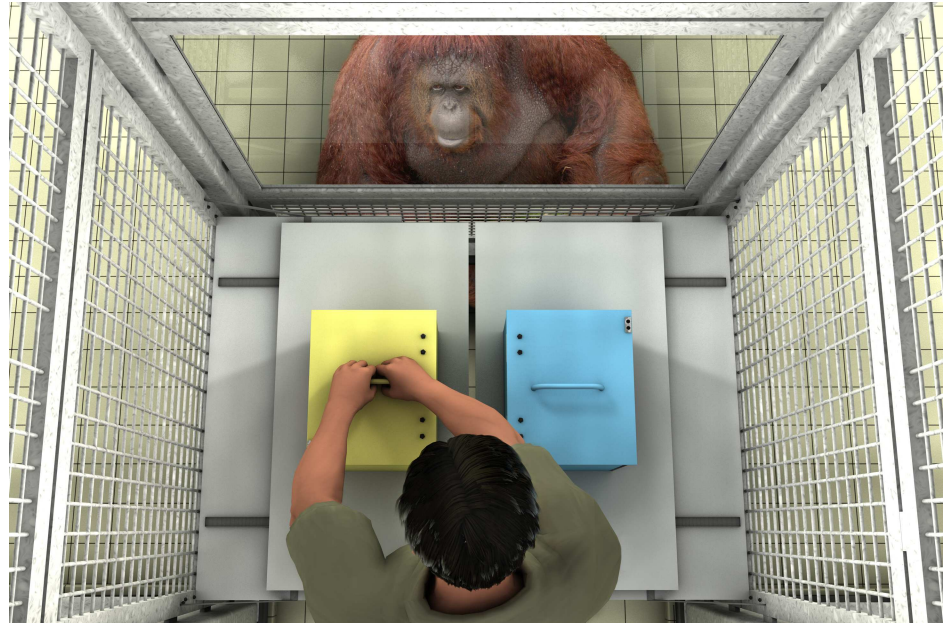
Fig 1. The set-up in Study 1. Right before the response phase, the experimenter tries to open the box which he believes contains his object (false-belief condition) or which he knows is empty (true-belief condition). In both conditions this is the same empty box; all that differs is the experimenter's belief about what is in it.

https://doi.org/10.1371/journal.pone.0173793.g001