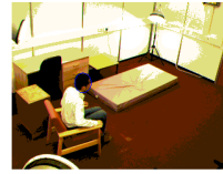
Frame No.400, Camera 1