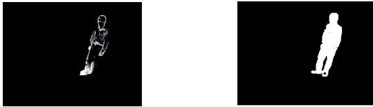
Fig. 2. MHI and background subtraction result for the slow walking case, C_{motion} = 26.33\%