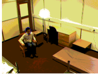
Frame No.400, Camera 2