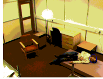
Frame No.600, Camera 2