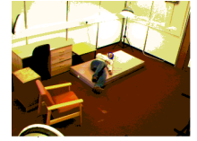
Frame No.600, Camera 1