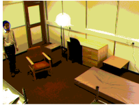
Frame No.1, Camera 2