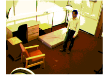
Frame No.200, Camera 1