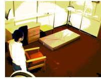
Frame No.1, Camera 1

Figure 5 and Figure 6 show some tracking results of the video streams taken by the two cameras.