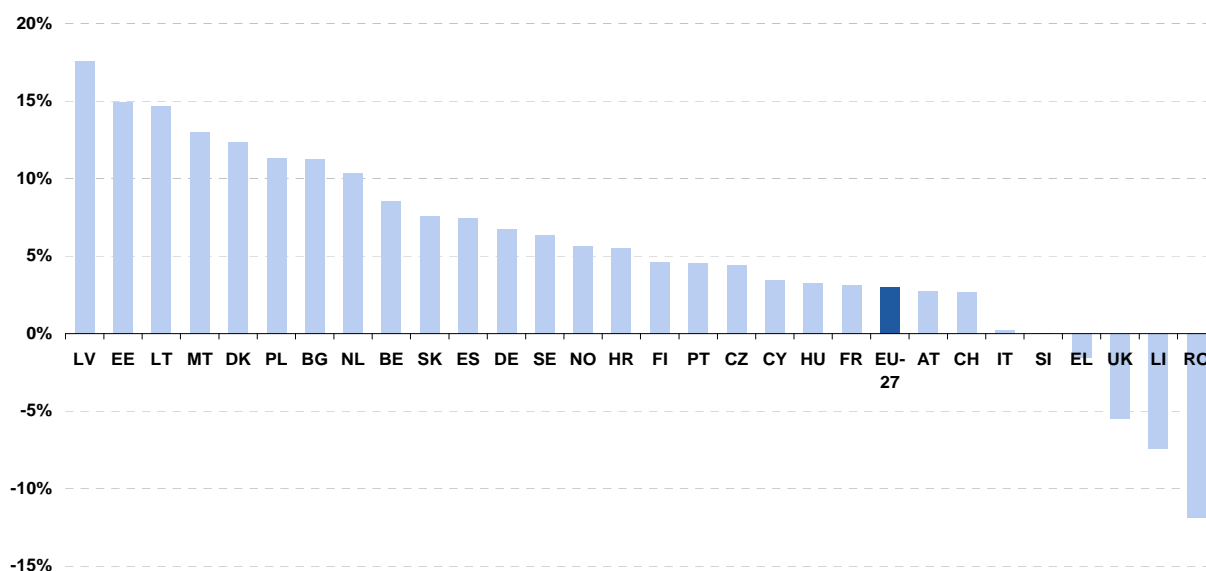
Figure 1: Percentage change in number of nights spent in hotels and similar establishments, non-residents and residents, June-September 2010 compared with the same period in 2009.

( 1 ) 2010 data not available for IE and LU. 2009 data have been used instead to estimate EU-27 aggregate for 2010.