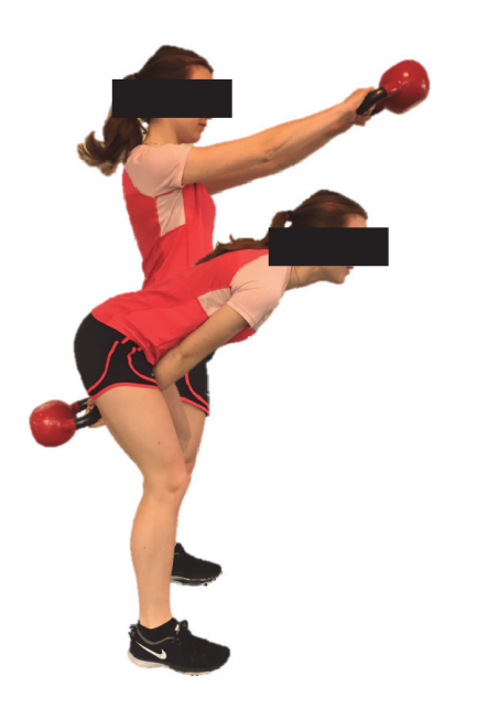
FIGURE 1: An illustration of the kettlebell swing exercise.