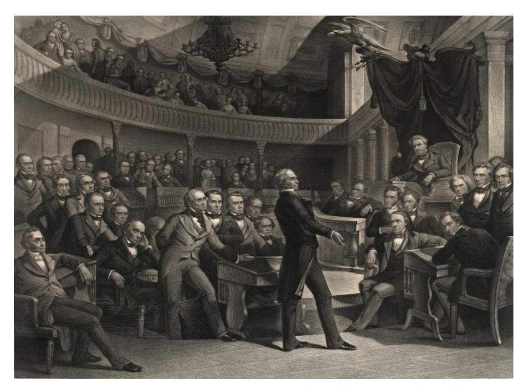
Although this image depicts Clay speaking in the Senate Chamber in 1850, the Kentuckian was known for his oration and leadership skills throughout Congress

Almost in diametric opposition to the institution one knows in the present age, the House of Representatives was an indistinctly-formed body that lacked specialization and hierarchy. As discussed earlier, the Jeffersonian Republican ideal of equality among legislators dictated that the House of Representatives operate much more in the way one thinks of the Senate today: members more or less had equal speaking rights and opportunities to serve on select committees, while strong leadership positions and rigid disciplinary structures were virtually absent. All forms of hierarchy and specialization were looked upon with suspicion, meaning that clear leadership