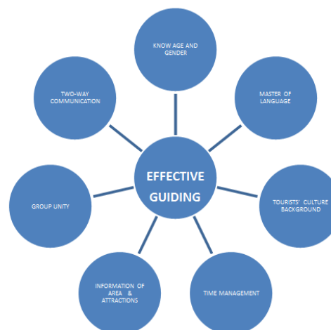
Figure 1: Requirements for effective guiding.

A tourist guide is a person who guides visitors in the language of their choice and explains the cultural and natural heritage of an area to ease understanding its meanings.